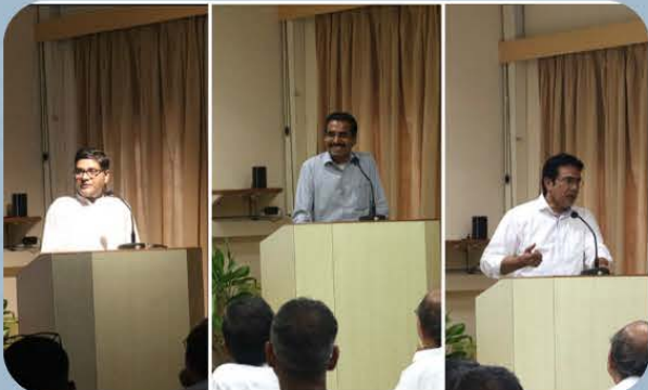
MBA Day 2022