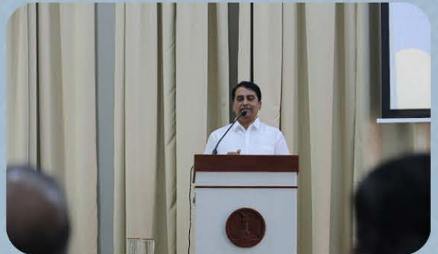
MBA Day 2023