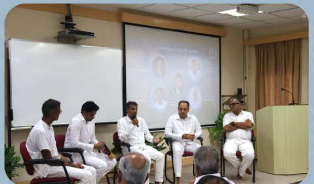
MBA Day 2022