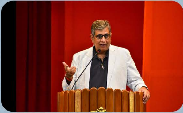
MBA Day 2024