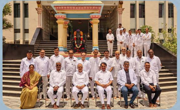
MBA Day 2024