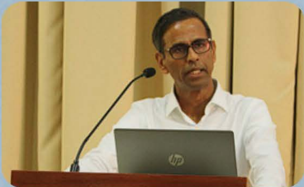
MBA Day 2023