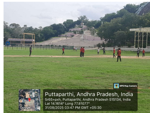
Dy. Director Physical Education